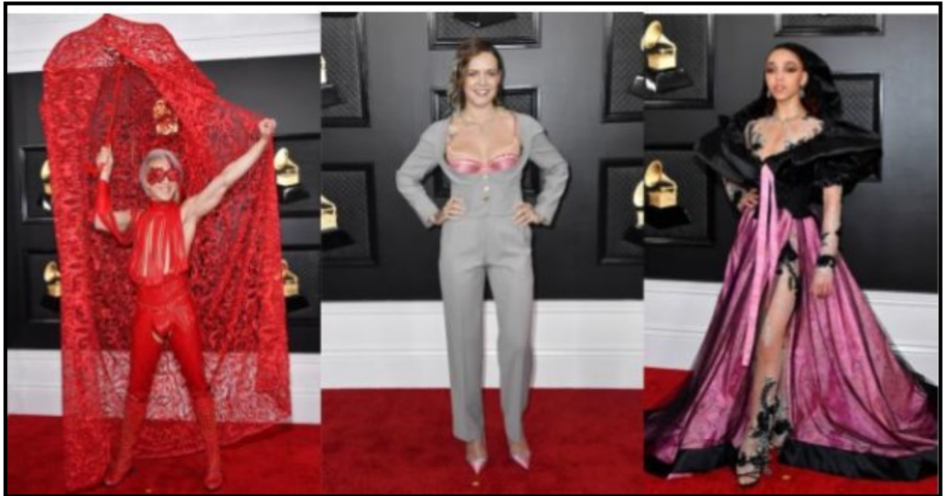
Red much? Singer-songwriter Ricky Rebel (up left picture) led the worst-dressed celebrities at the 2020 Grammy Awards in a bizarre red ensemble with an enormous umbrella. Confusing dress! FKA Twigs (right up picture) wore a bizarrely gothic ensemble that flashed a lot of thigh, and left her looking like a character from a Victorian horror movie. Maybe a little too much? Tove Lo (middle picture), a singer, wore a half-open grey suit with a very low v-neck, which allowed her to show off a pink bra

Worst-dressed celebrities on red carpet (right and below), who didn't think twice before wearing it