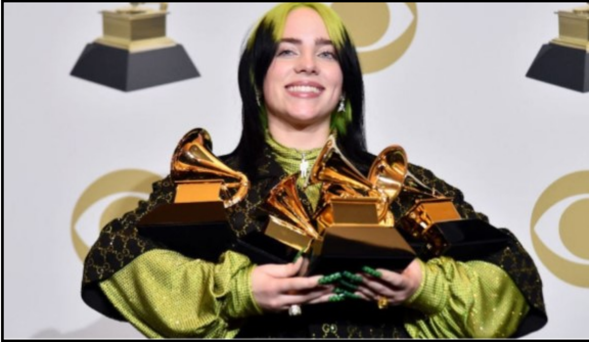
As a new artist to the scene, Billie Eilish ran away with many major awards at this year’s Grammys including Record of the Year, Album of the Year, Song of the Year, and Best New Artist

Disclaimer: If you haven’t watched the Grammy Awards yet, be sure to go on YouTube and watch it.