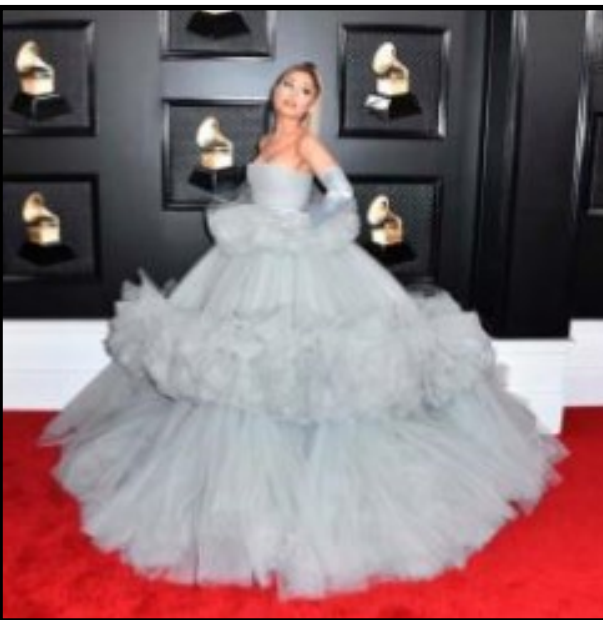
Ariana Grande, with 5 nominations, who also performed "go b it or go home". Come with long silver-Come with long off shoulder silver-gray dress with the same colored gloves.