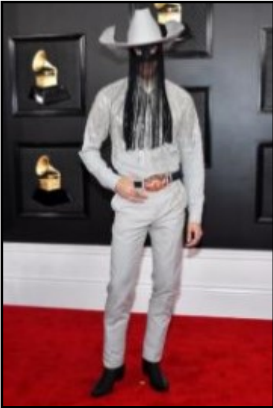
Top of the flops: Orville Peck's face mask made him look like he was wearing a Halloween costume, while his shiny suite take our eyes off of it